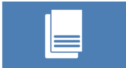
Subject Benchmark Statements