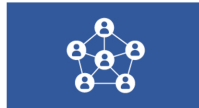
Higher Education Credit Framework for England