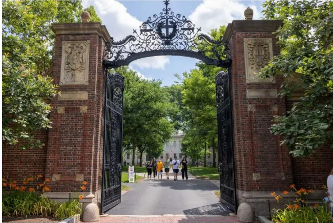
The entrance to Harvard Yard.